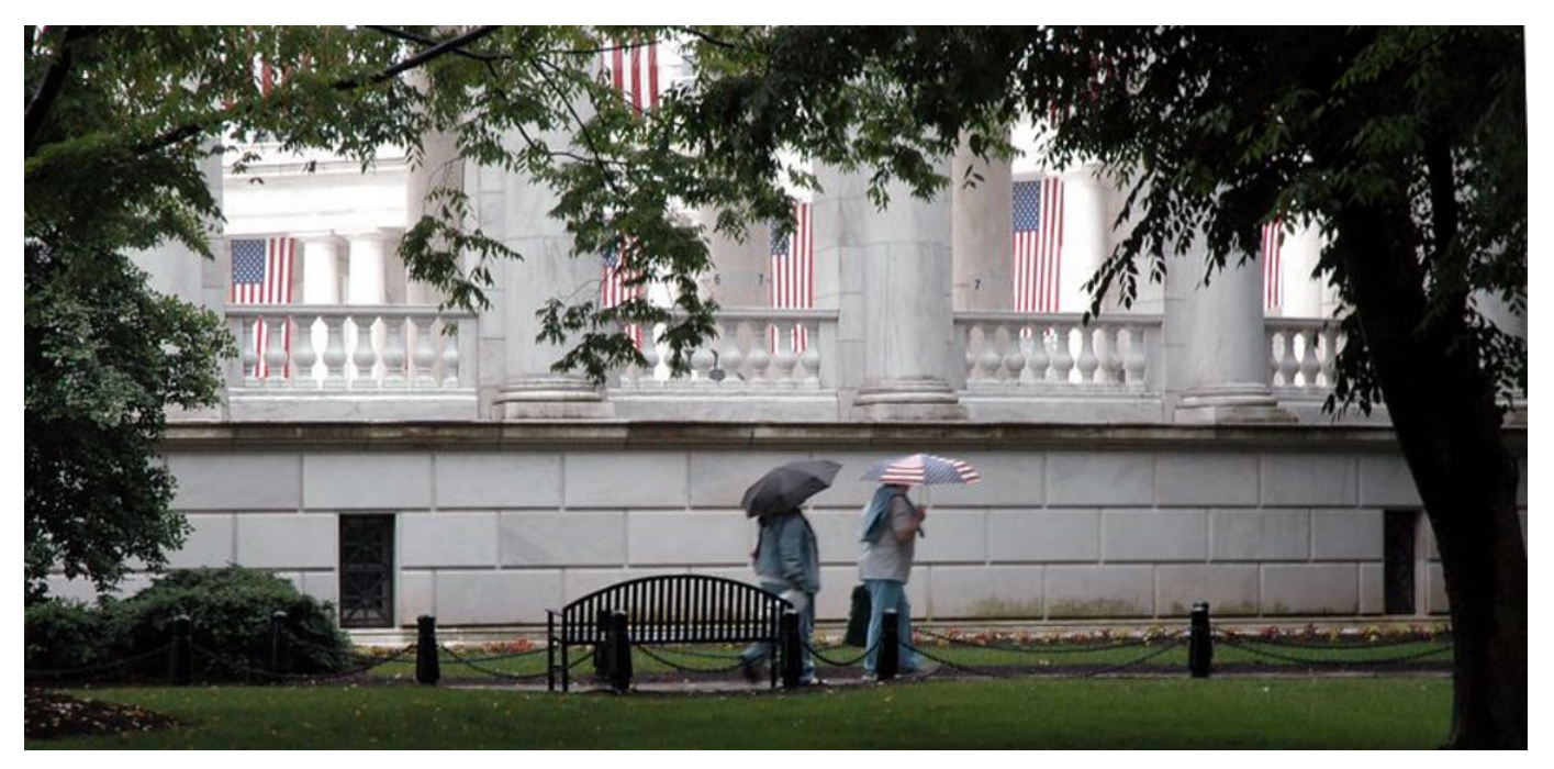
The Tomb of the Unknown

And when you stand before my grave Think not of one, but each who gave.