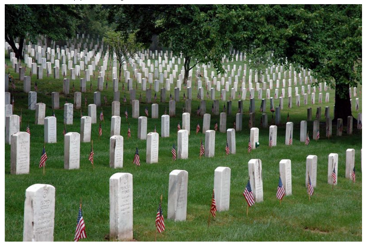
Patriots Church Children's Bible Studies 2006

"surcease" means to stop, pause, halt; bring to an end.