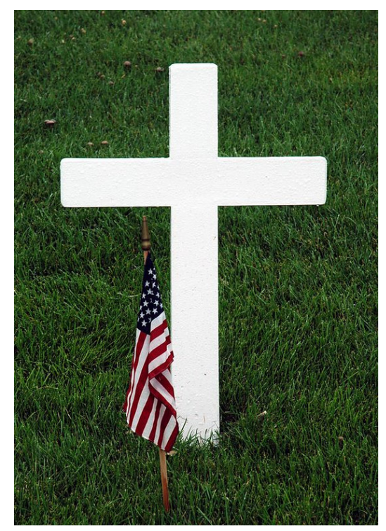
Patriots Church Children's Bible Studies 2006

Your memories, brought forth this day, Send love to us, who could not stay.